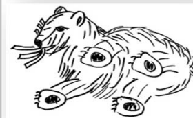
Second Beast--Bear Three ribs in its mouth represent three kings who release the captives