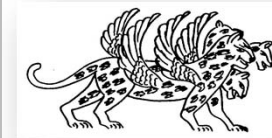
Third Beast--Leopard in