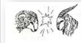
Medo/Persians and Macedonians bump heads Macedonian, Alexander the Great wins.