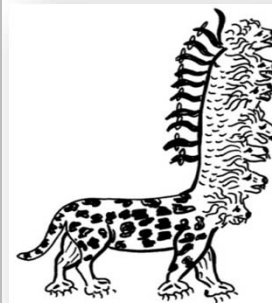
Fourth Beast: Has the spirit of all three beasts, body of a leopard, feet of a bear, and teeth of a lion